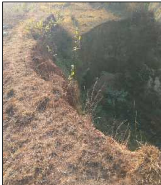
b) Gullies Formation in Raatmate Site