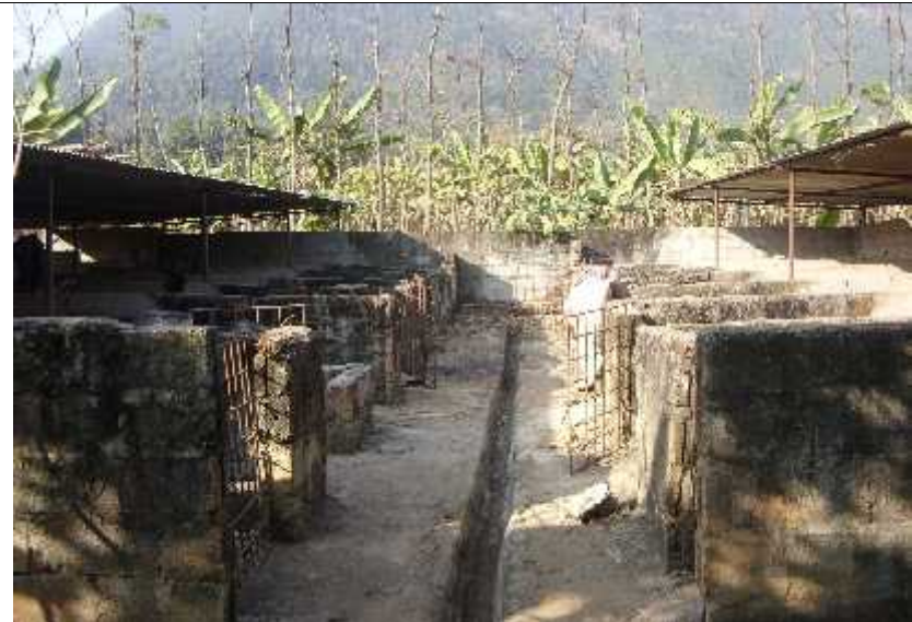
Figure III: Abandoned Pig Farm