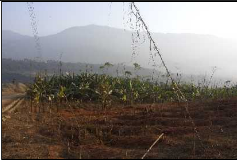
Figure I: Keraghari area