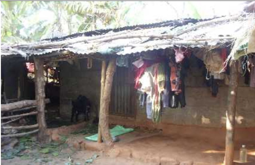
Figure III: Affected House