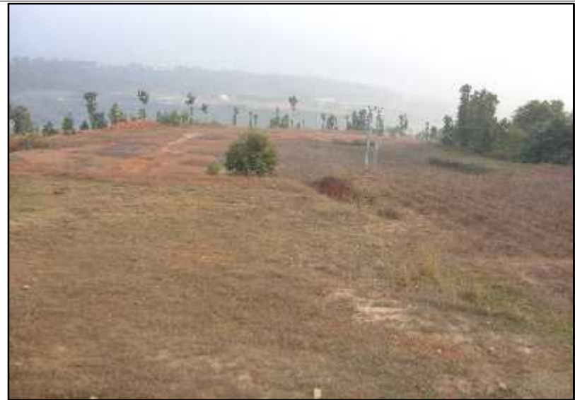
Figure II: Raatmatey area