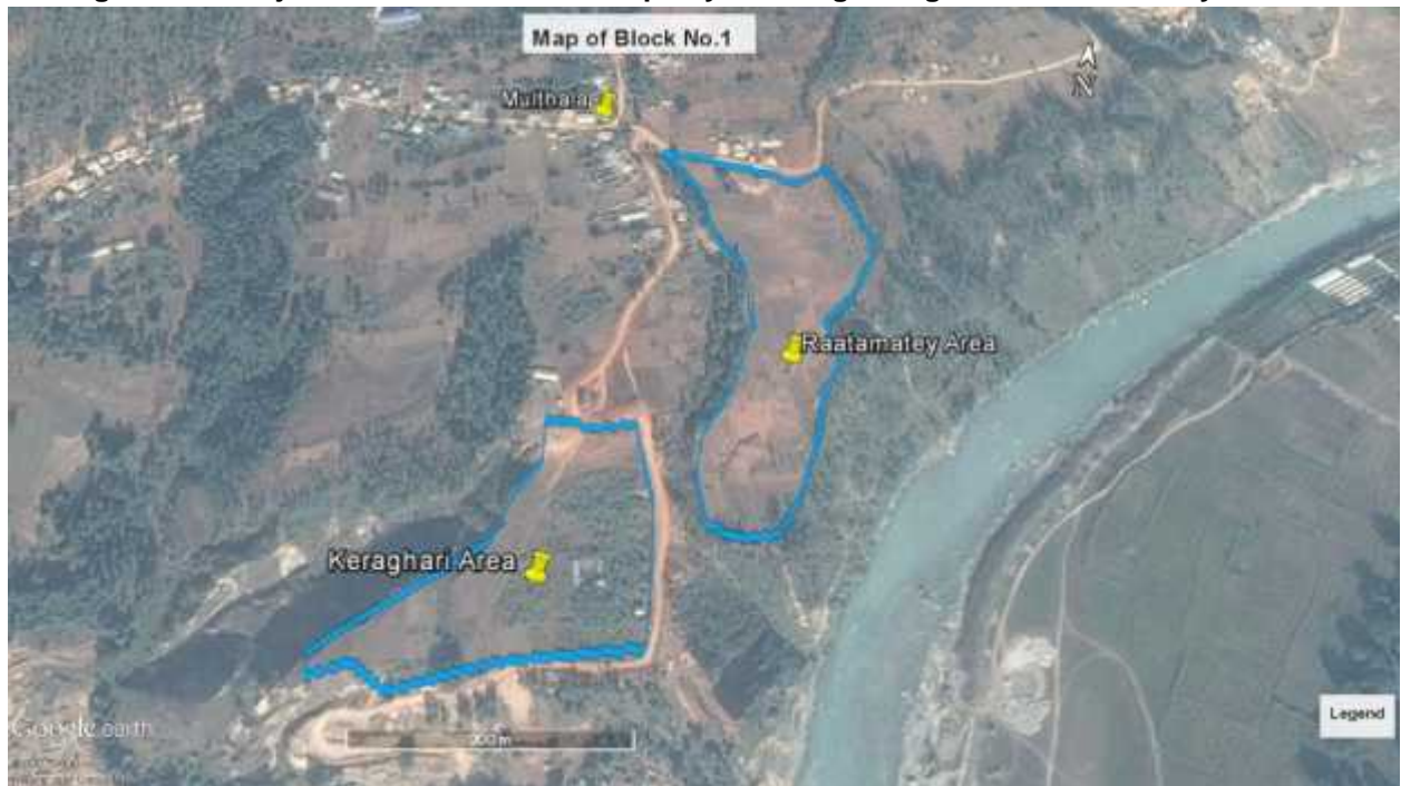
Figure 1-3: Google image of Keraghari and Raatmatey area